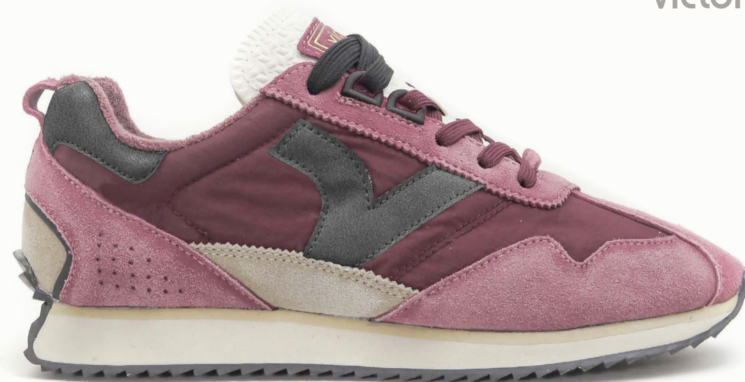
PROTOTYPE PICTURE: This is not the final sample, and might be some small color/texture changes.