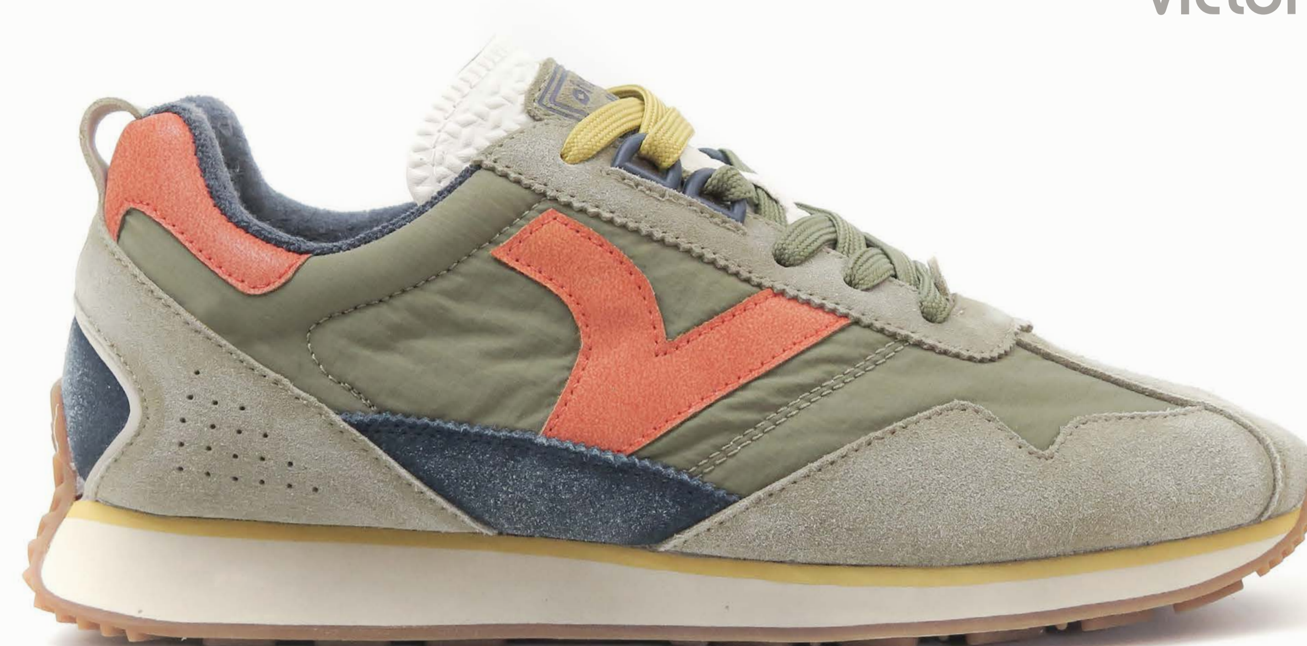
PROTOTYPE PICTURE: This is not the final sample, and might be some small color/texture changes.