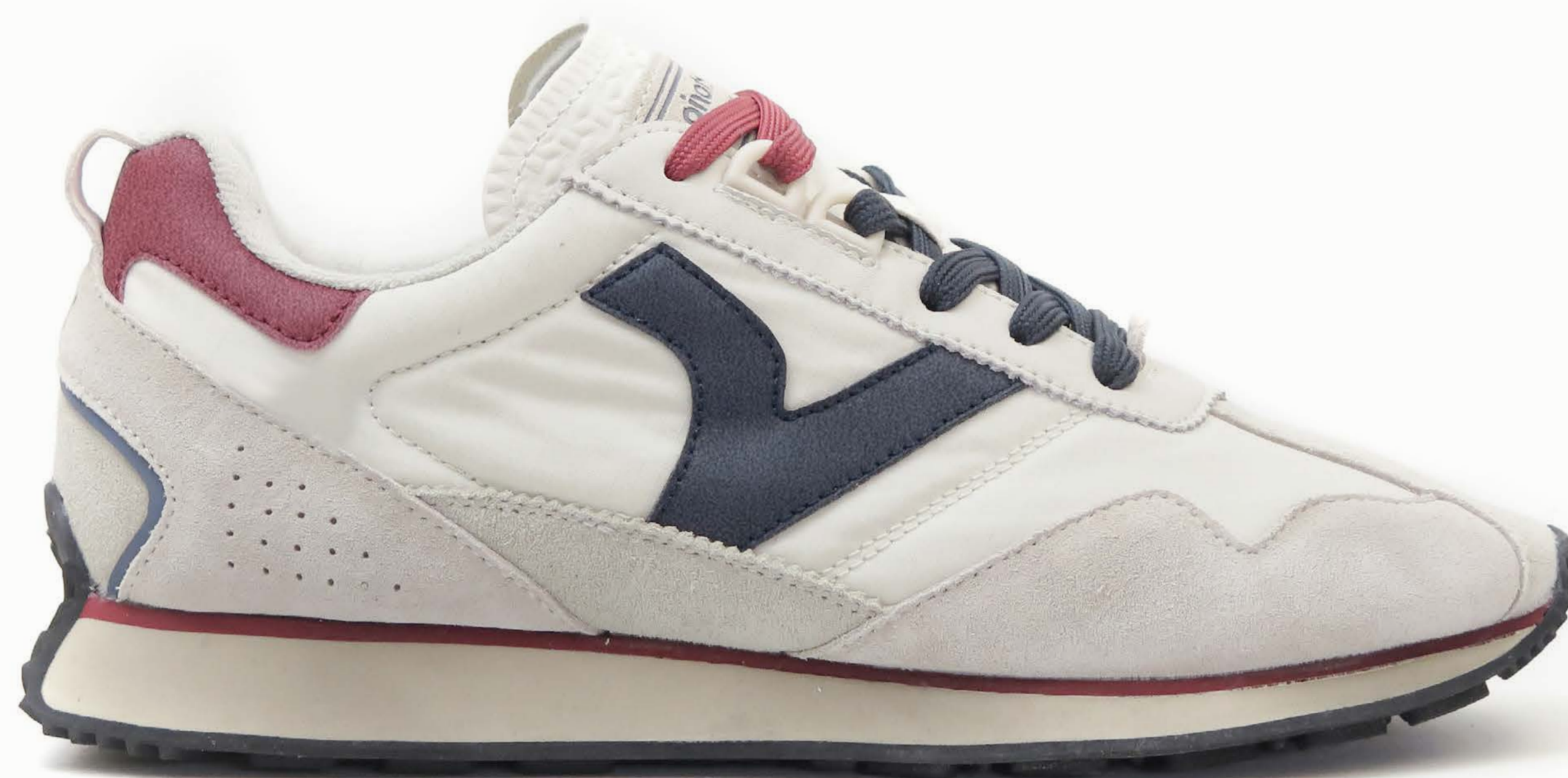
PROTOTYPE PICTURE: This is not the final sample, and might be some small color/texture changes.