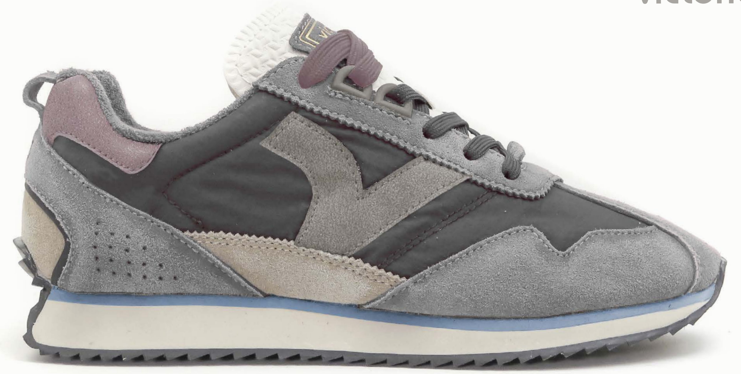
PROTOTYPE PICTURE: This is not the final sample, and might be some small color/texture changes.