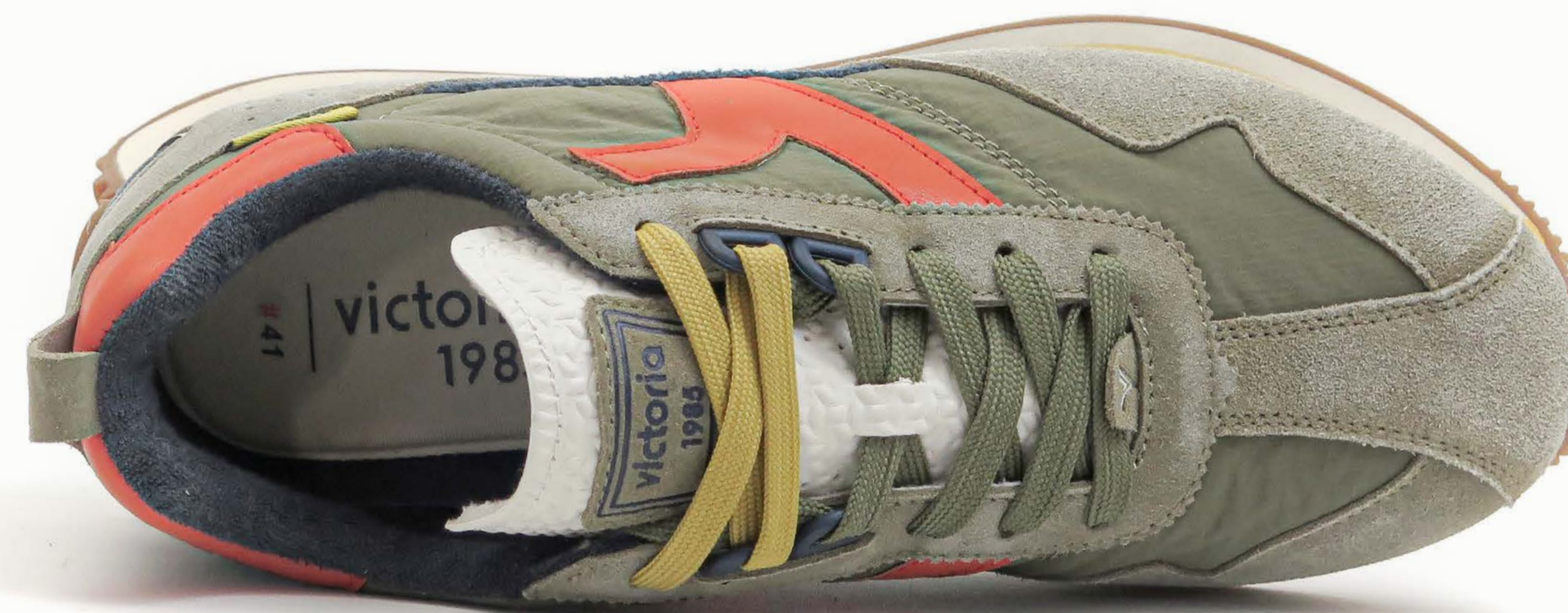
Upper: Cow Suede (55%), Soft Nylon (35%), Soft PU (10%) - Lining: Mesh (80%), Micro suede fabric (20%) - Outsole: Recycled natural rubber - Midsole: 2 color EVA foam.