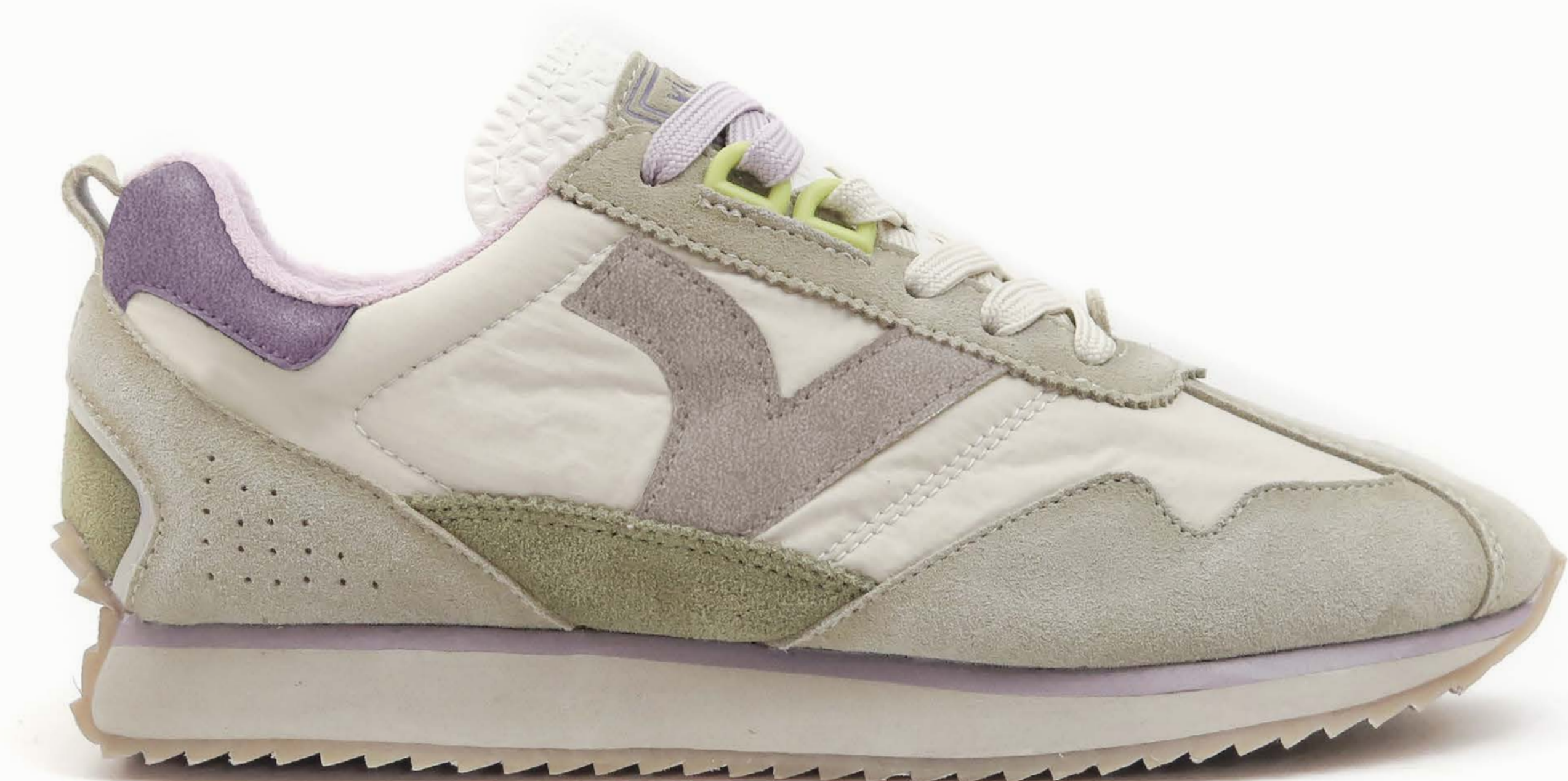
PROTOTYPE PICTURE: This is not the final sample, and might be some small color/texture changes.