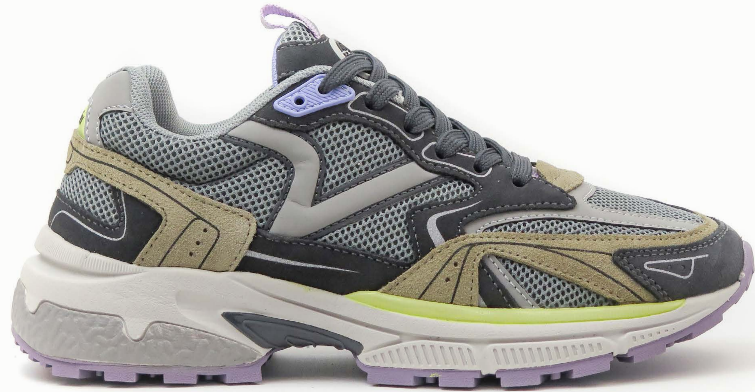
PROTOTYPE PICTURE: This is not the final sample, and might be some small color/texture changes.