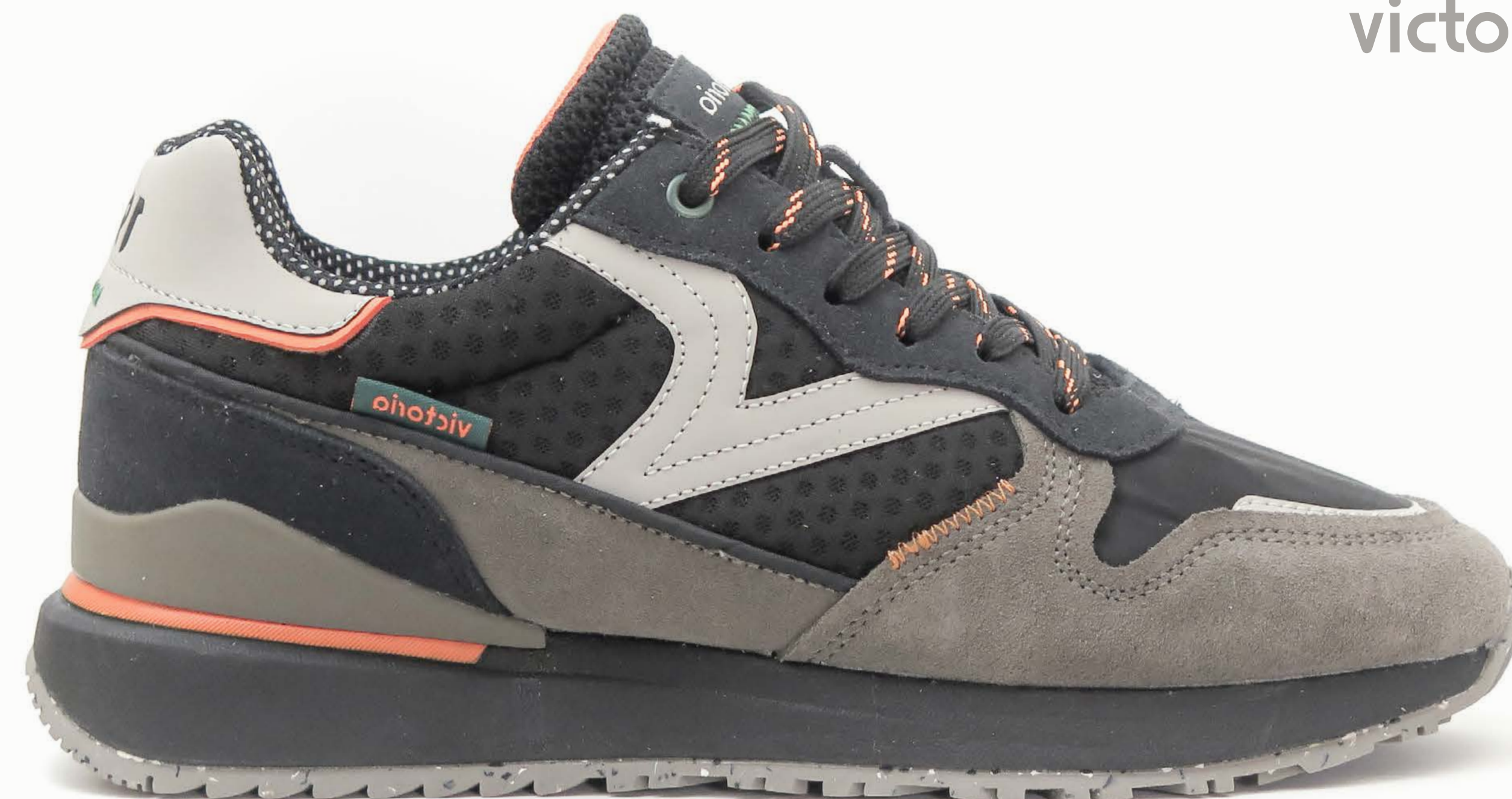
PROTOTYPE PICTURE: This is not the final sample, and might be some small color/texture changes.