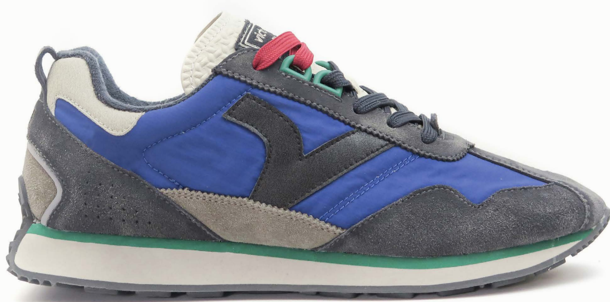
PROTOTYPE PICTURE: This is not the final sample, and might be some small color/texture changes.