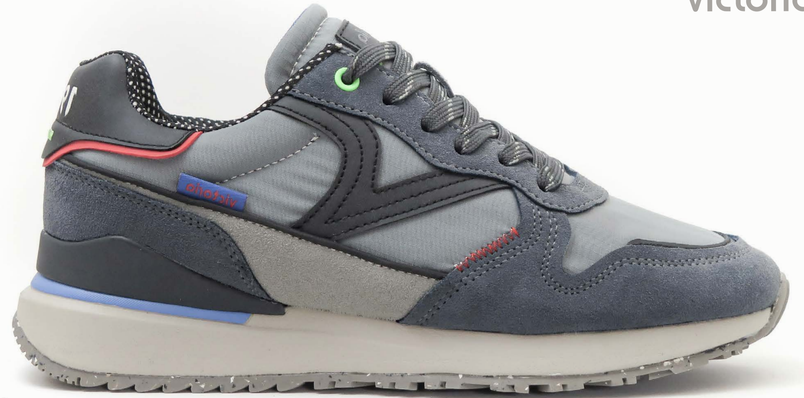
PROTOTYPE PICTURE: This is not the final sample, and might be some small color/texture changes.