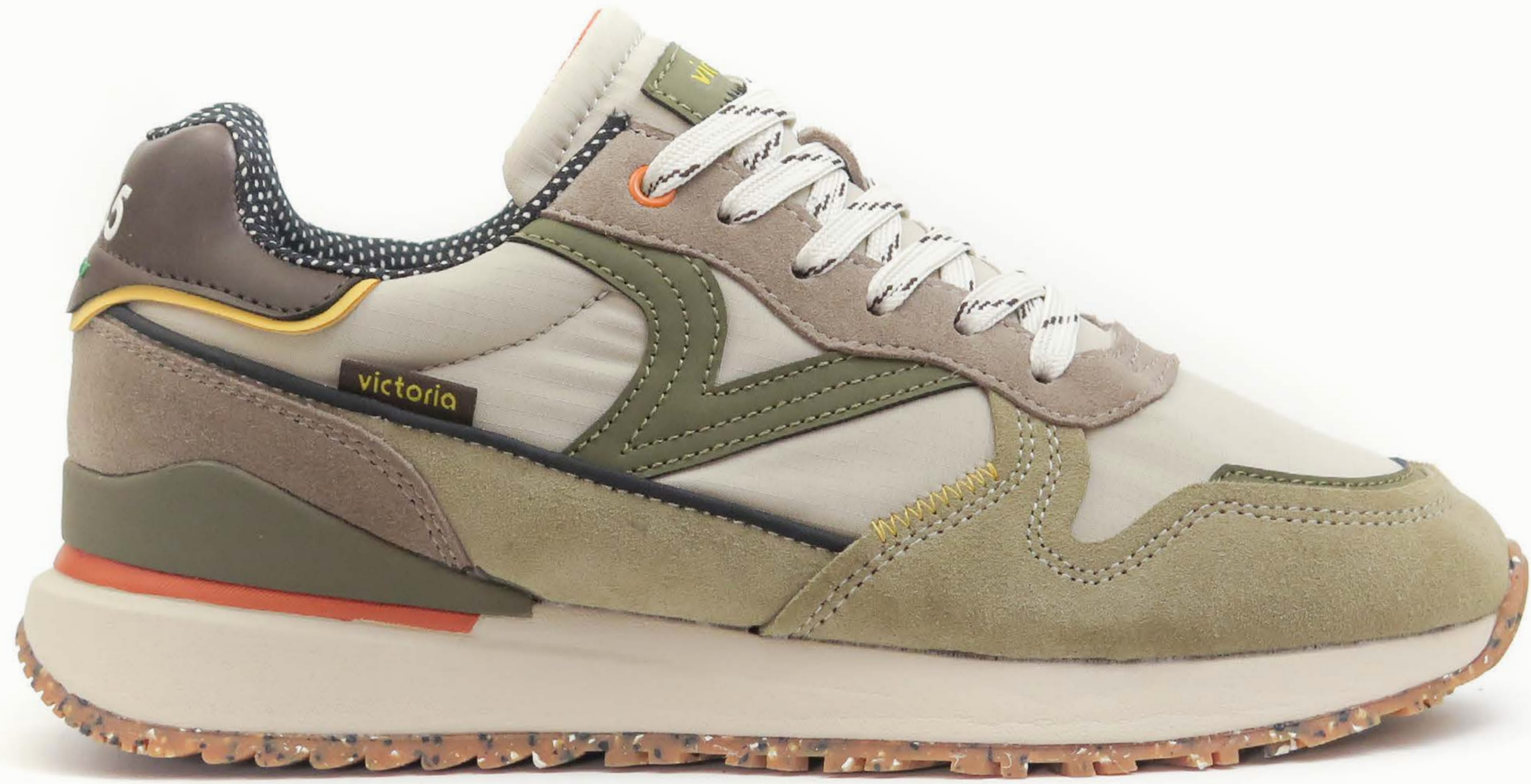
PROTOTYPE PICTURE: This is not the final sample, and might be some small color/texture changes.