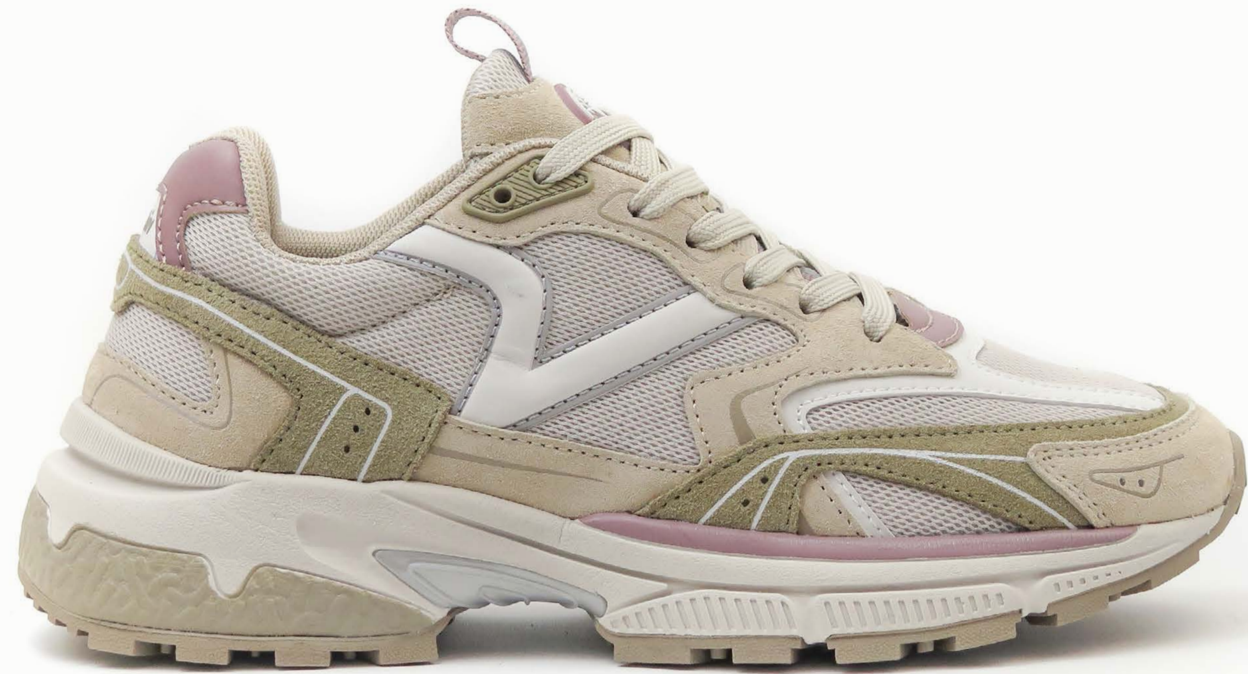
PROTOTYPE PICTURE: This is not the final sample, and might be some small color/texture changes.