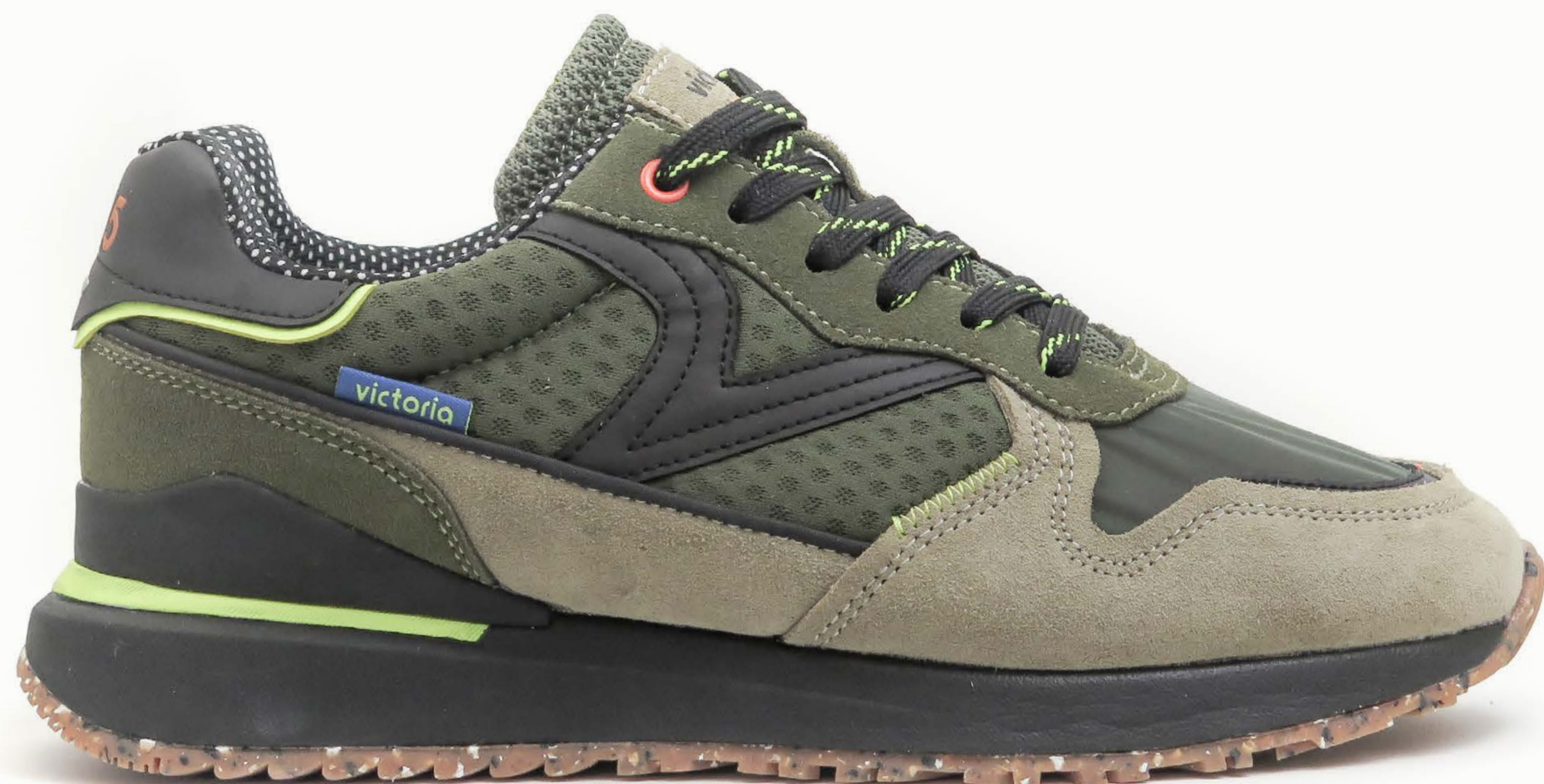
PROTOTYPE PICTURE: This is not the final sample, and might be some small color/texture changes.