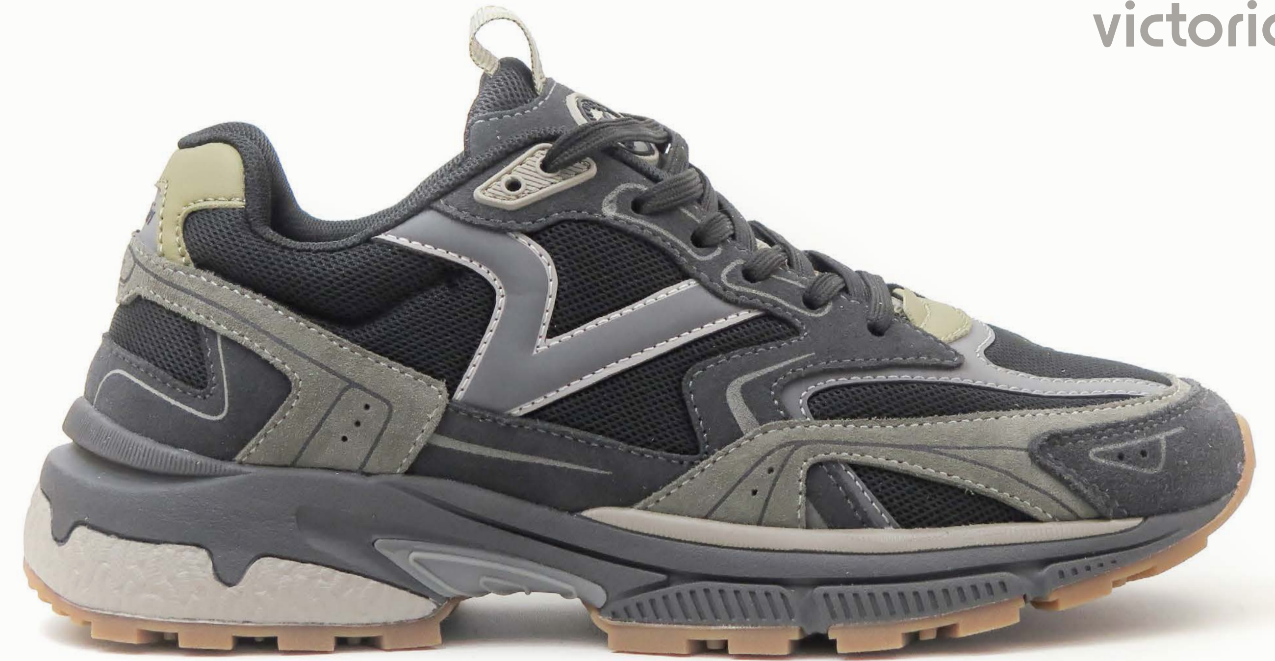
PROTOTYPE PICTURE: This is not the final sample, and might be some small color/texture changes.