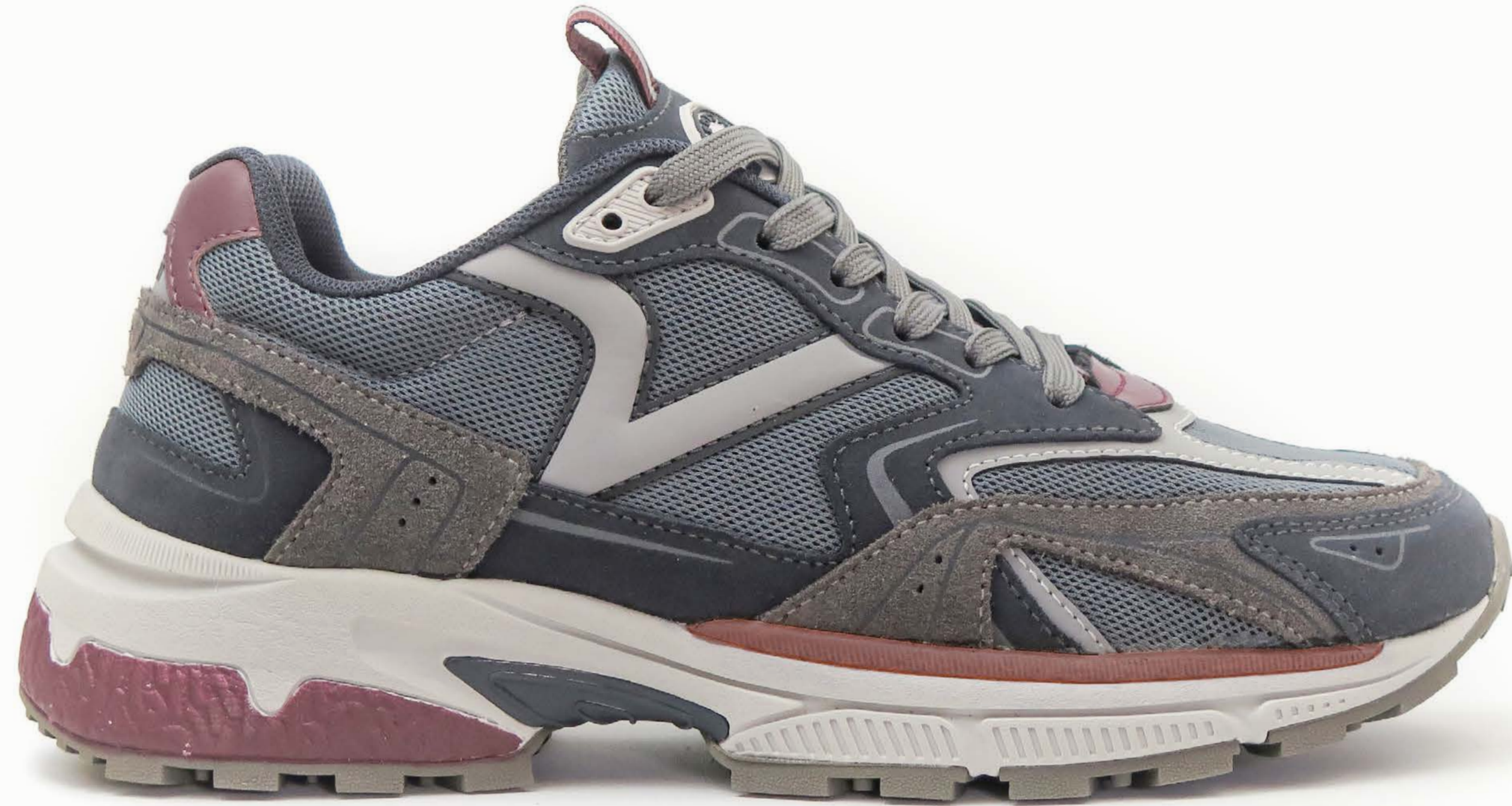
PROTOTYPE PICTURE: This is not the final sample, and might be some small color/texture changes.