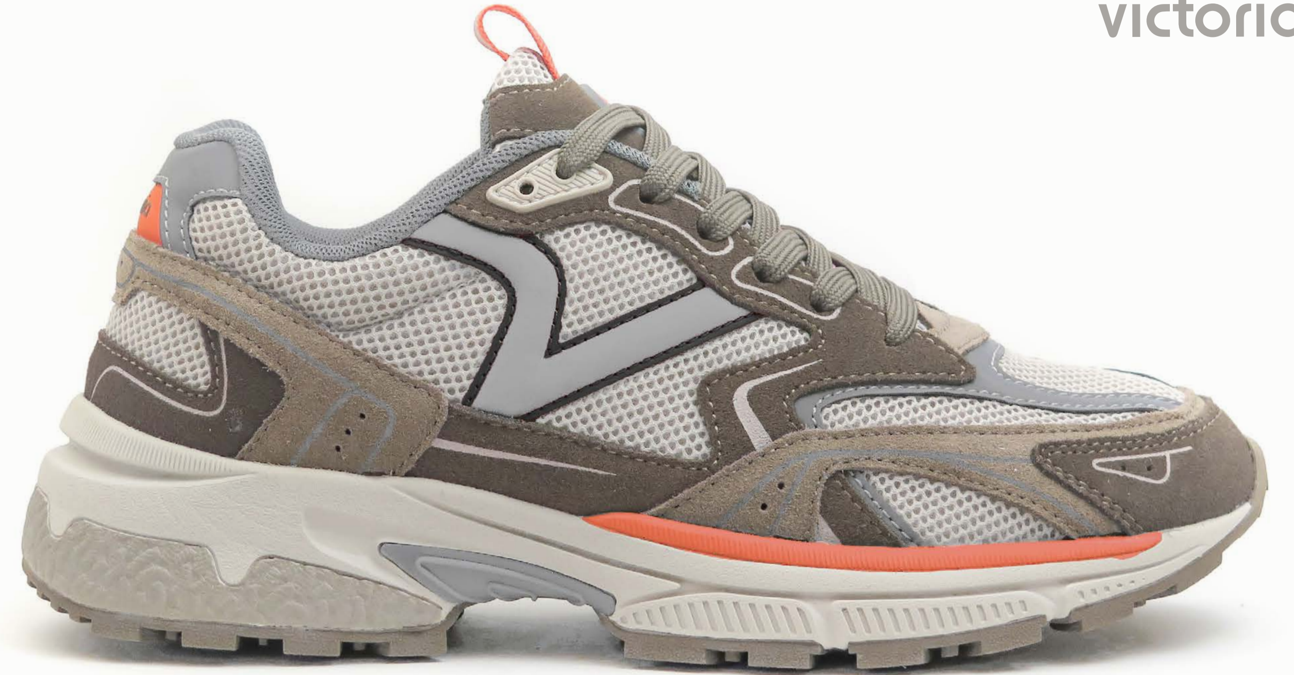
PROTOTYPE PICTURE: This is not the final sample, and might be some small color/texture changes.