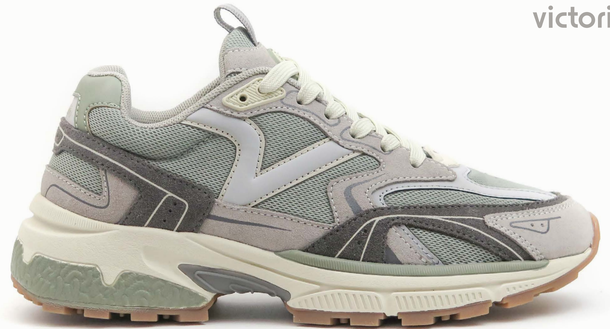
PROTOTYPE PICTURE: This is not the final sample, and might be some small color/texture changes.