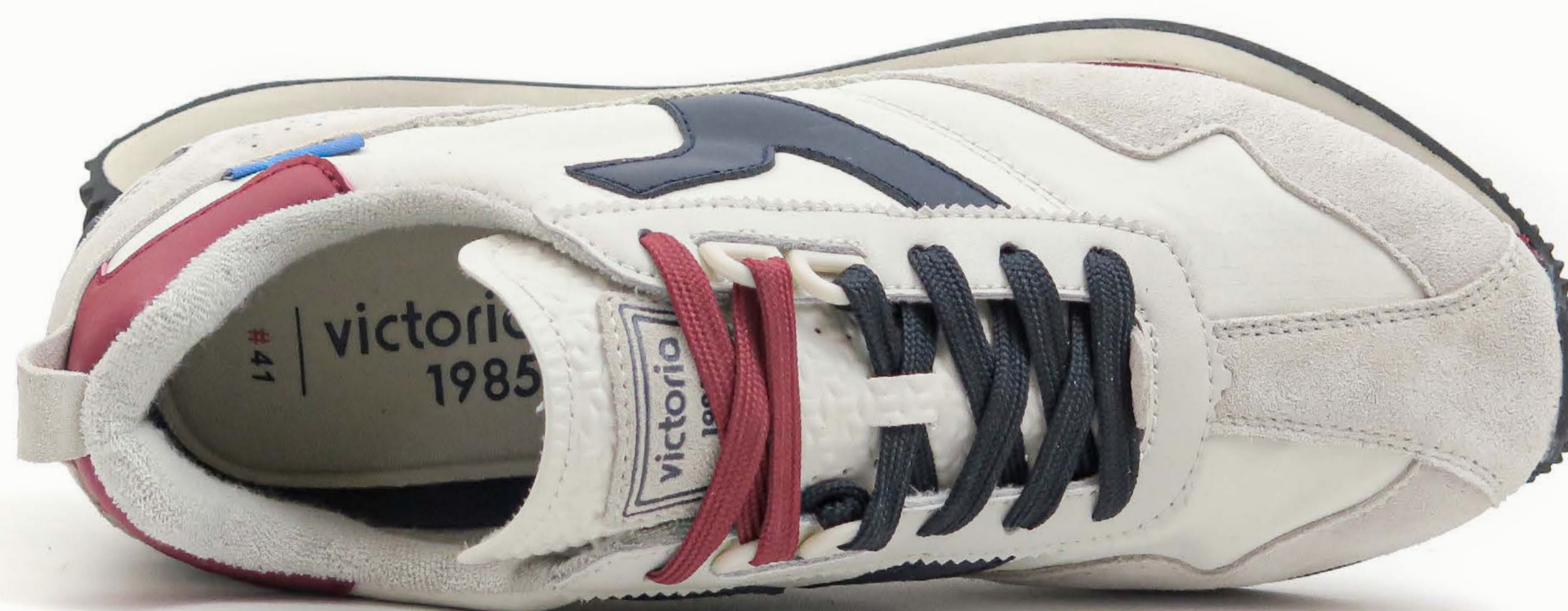
Upper: Cow Suede (55%), Soft Nylon (35%), Soft PU (10%) - Lining: Mesh (80%), Micro suede fabric (20%) - Outsole: Recycled natural rubber - Midsole: 2 color EVA foam.